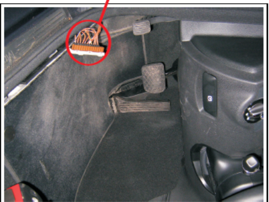
Konektor v levém prahu